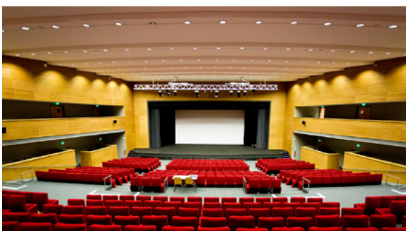
The University of Caen - Amphithéâtre Pierre Daure.