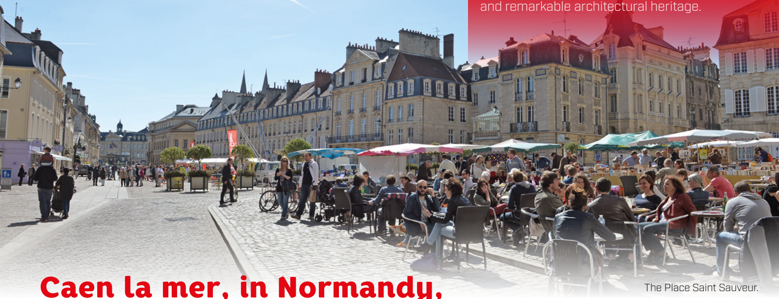
The Place Saint Sauveur.

Caen is a city on a human scale with a wide range of attractions: a marina in centre of the city, vast green spaces, famous gastronomy, dynamic night life (35,000 students), a rich cultural provision and remarkable architectural heritage.