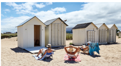
Ouistreham - Riva-Bella.

Caen is an attractive city drawing visitors from all over the world who come to see the Norman abbeys, medieval castle, townhouses and museums, including the Caen Memorial, which earned Caen the “City of Peace” award from UNESCO in 1999. With no less than 81 listed buildings, Caen has been nicknamed the “city of a hundred spires”.