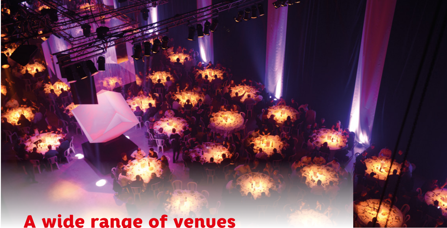
The Caen Zenith.