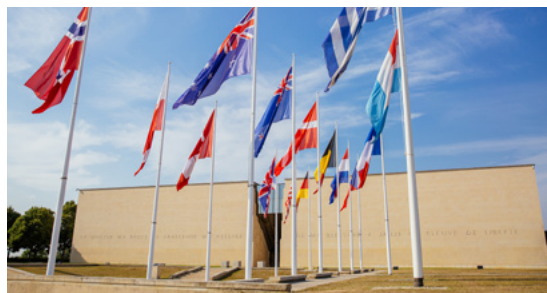
The Caen Memorial.

Strongly attached to its values, Caen la mer is a city that will always leave visitors the freedom to make their own choices – which are vast, since the city has everything!