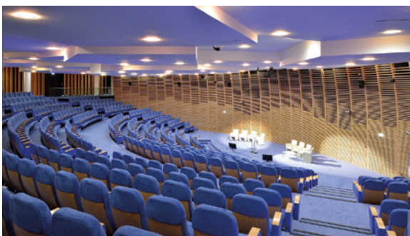
The Crédit Agricole conference centre.