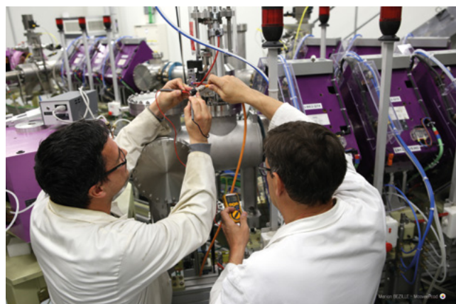
Ganil - Spiral2.

Awarded the "Normandy French Tech" label in 2019