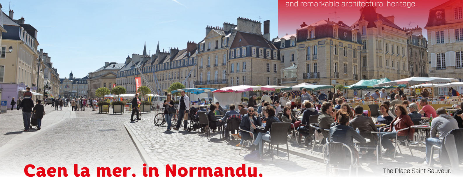
The Place Saint Sauveur.

Caen is a city on a human scale with a wide range of attractions: a marina in centre of the city, vast green spaces, famous gastronomy, dynamic night life (35,000 students), a rich cultural provision and remarkable architectural heritage.