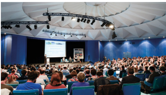
The Caen Congress Centre.

We can offer a vast range of venues in the city, beside the sea or in the country to host your business events (congresses, seminars, conventions, conferences, annual assemblies, gala evenings, etc.) for up to 4,500 people.