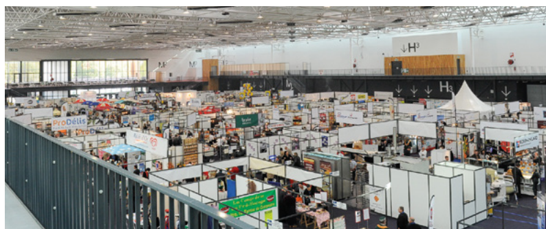
The Caen Exhibitions Centre.

The Caen congress centre , at the heart of the city, with a comfortable amphitheatre with 539 places, a multi-functional 1014 m 2 space and 6 to 9 workshop rooms.