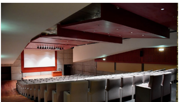
The Fine Arts Museum - Auditorium.